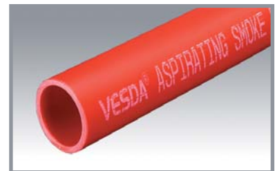
VSM4, VSC and ASPIRE2 are compatible with all detectors in the VESDA product line